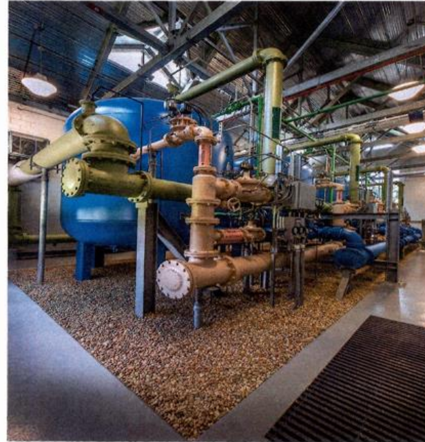
New Green Sand Filter or Aeration Filter WFP